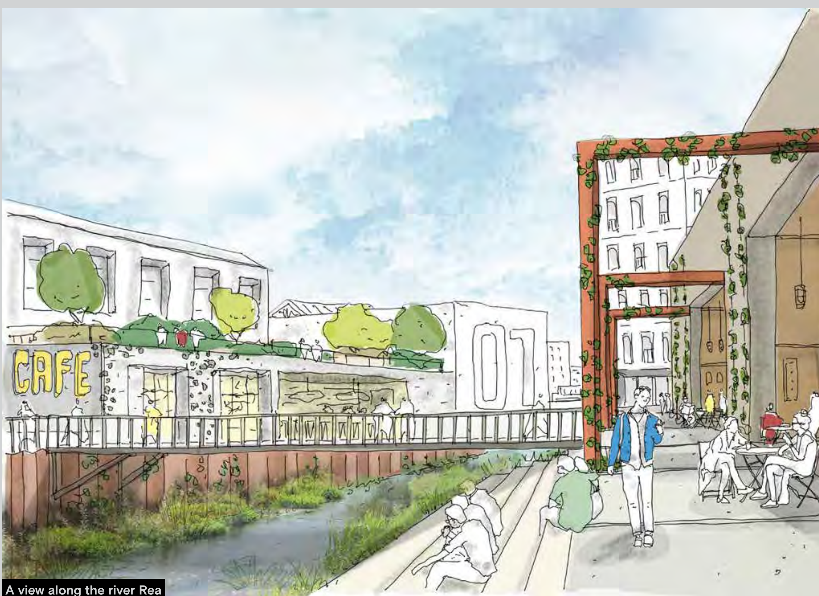
A view along the river Rea