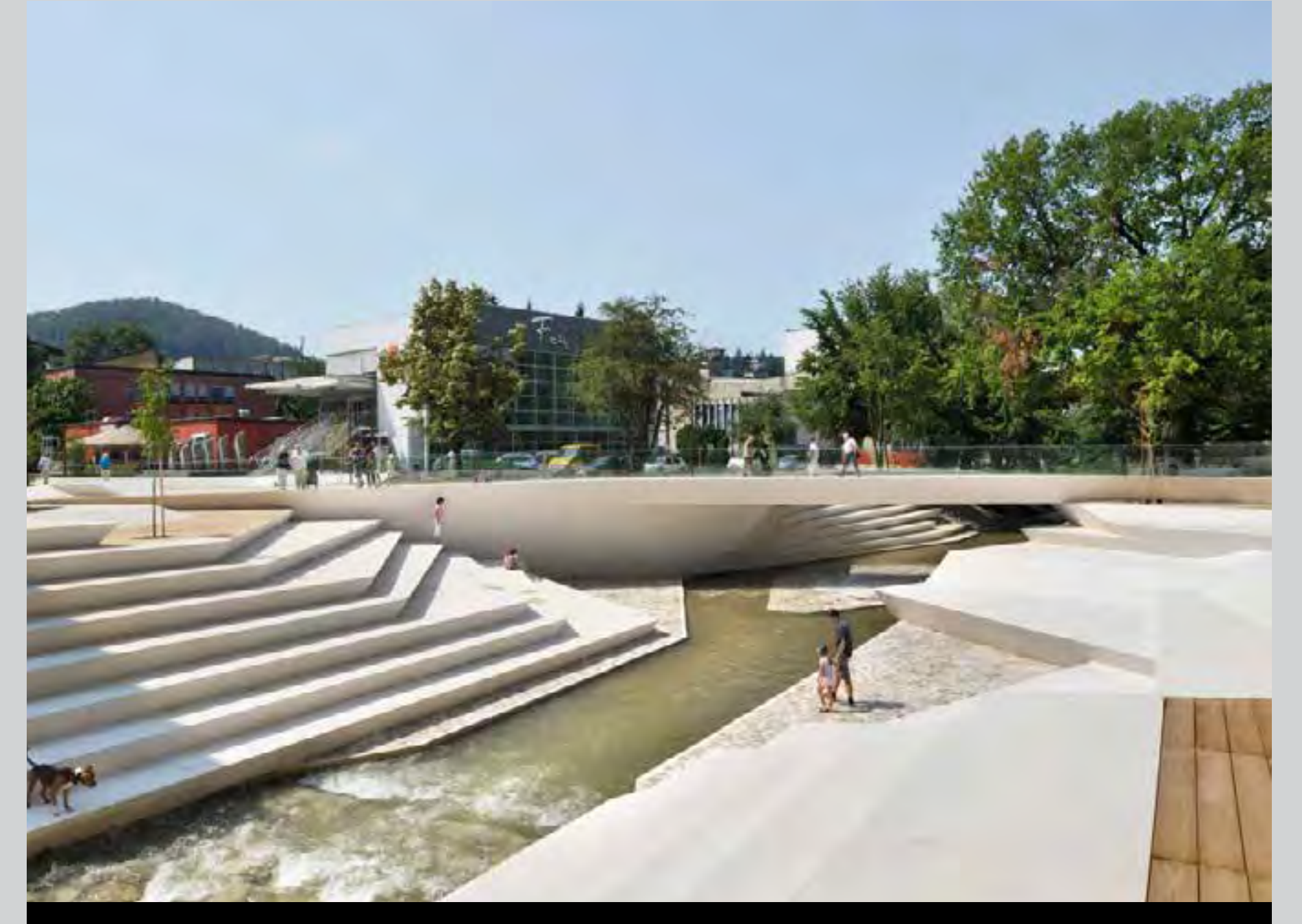
Strategic use of planting focused around past and present waterways