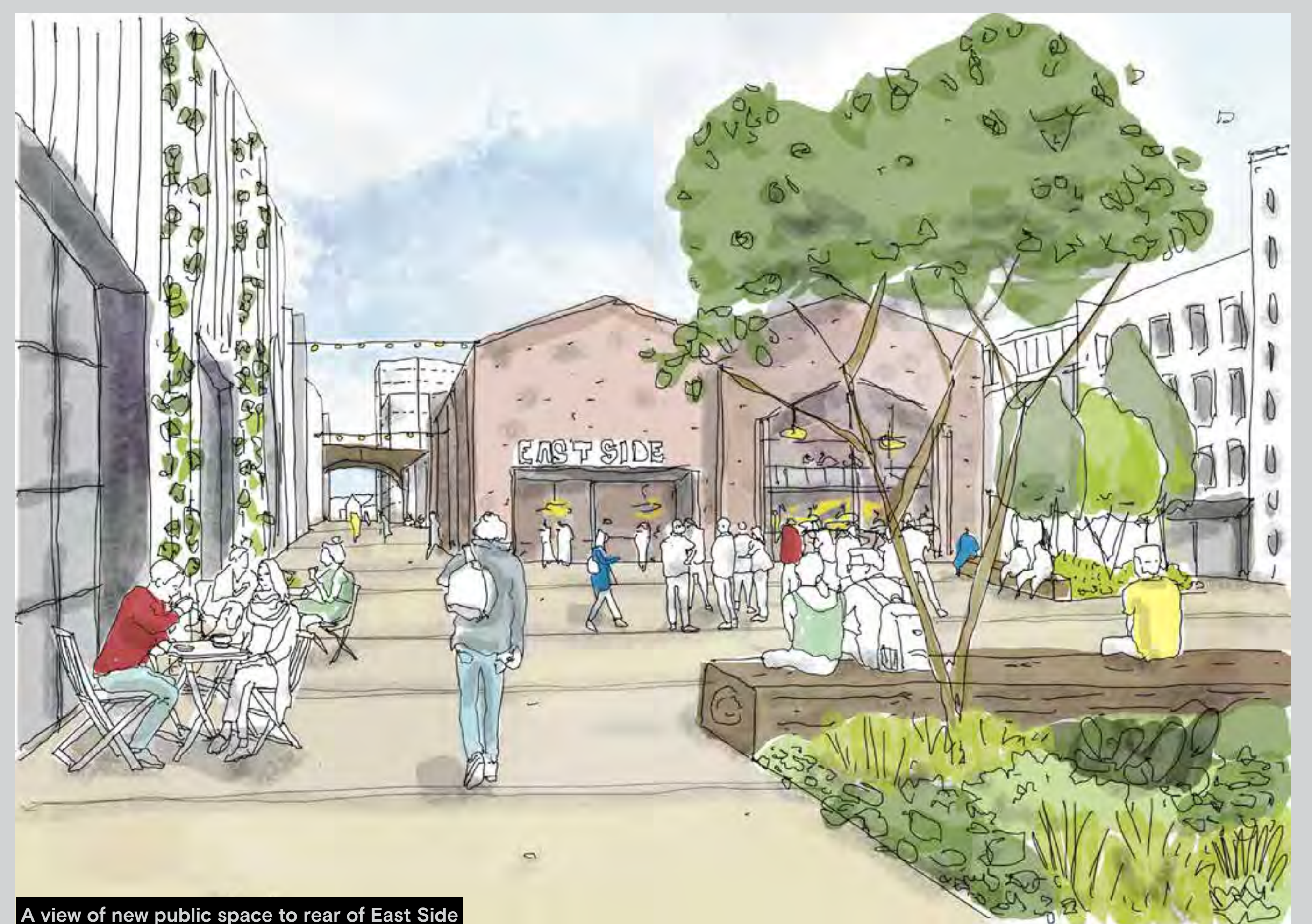
A view of new public space to rear of East Side