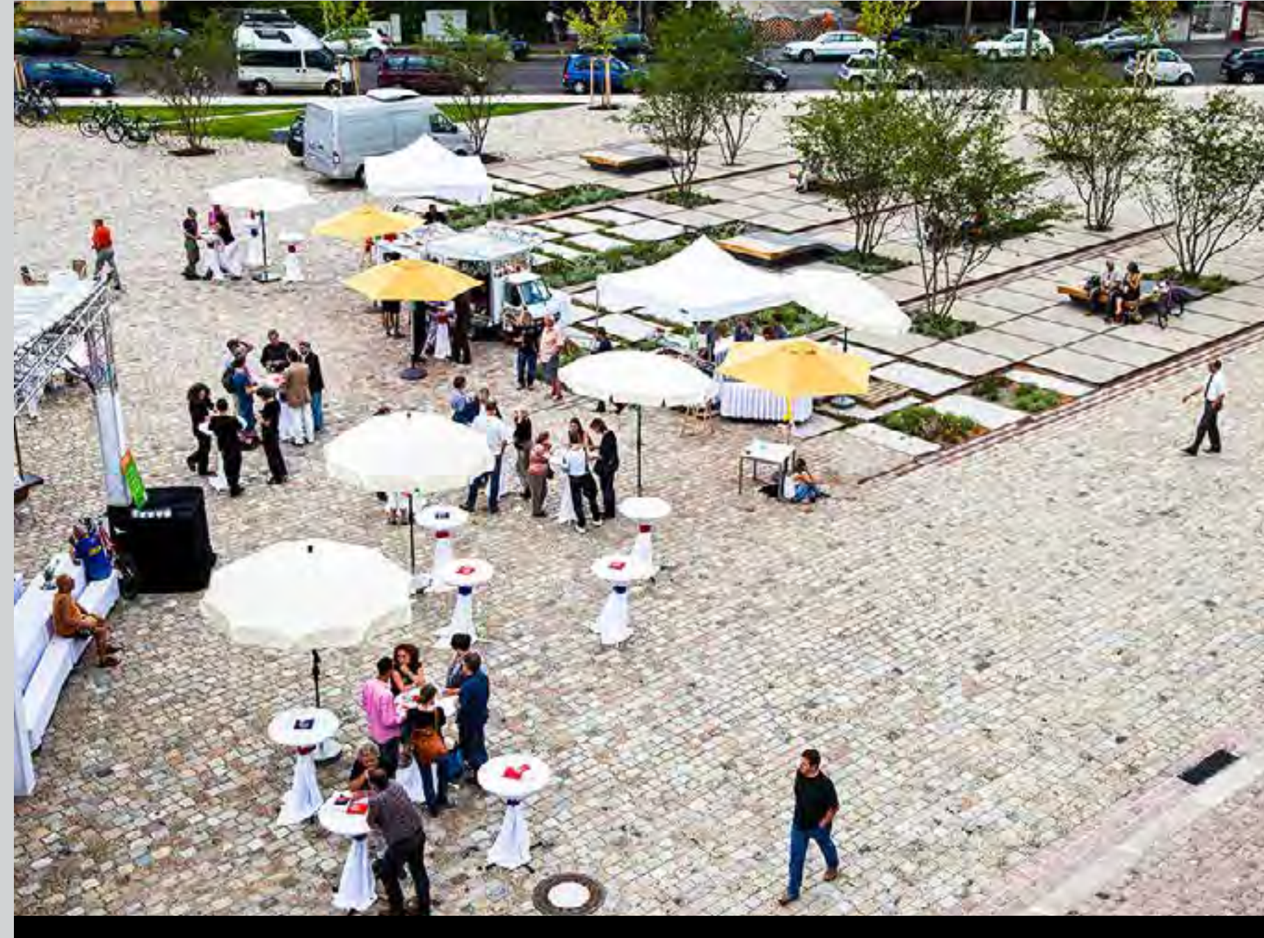
A programmed Digbeth that supports its community and cultural momentum